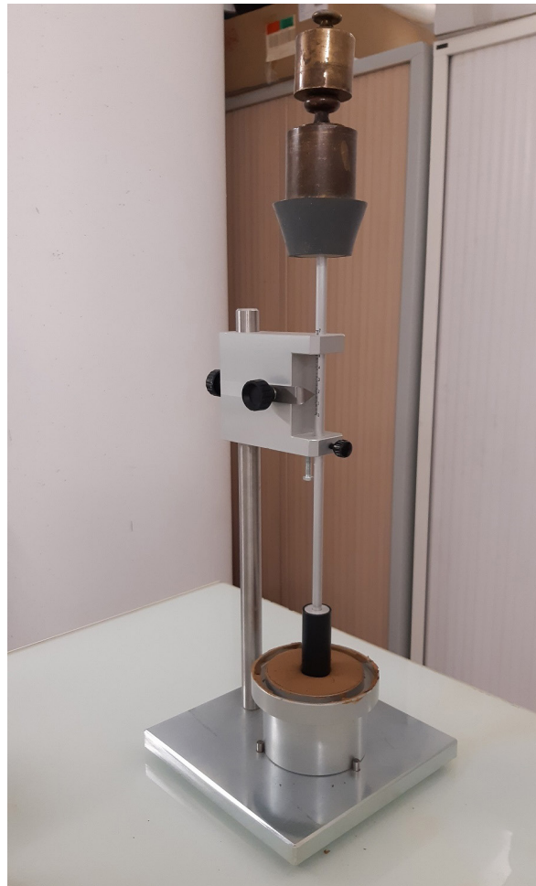
02 Using the weighted plunger test to ascertain the yield stress of the earth sample

The weighted plunger test is inspired by the NF EN 413-2:2017 standard [15] which evaluates the consistency of mortars. The principle involves releasing a plunger from a height of 100 mm and allowing it to fall on the tested mortar. The penetration distance is then measured.